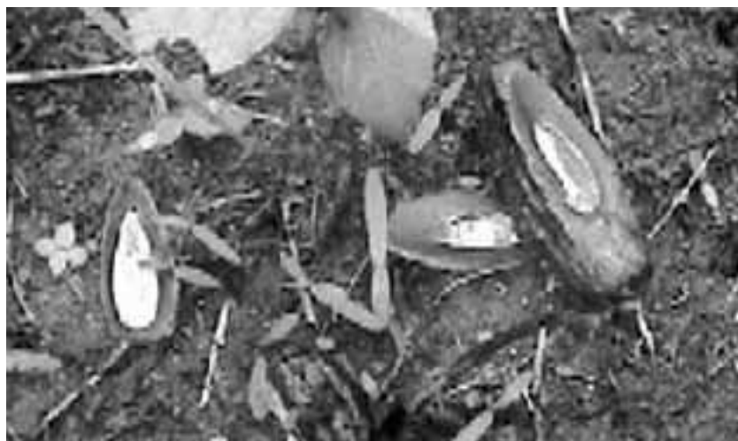
Figure 3 Seeds of Cordia millenii which were evacuated by chimpanzees and then destroyed by yellow baboons.