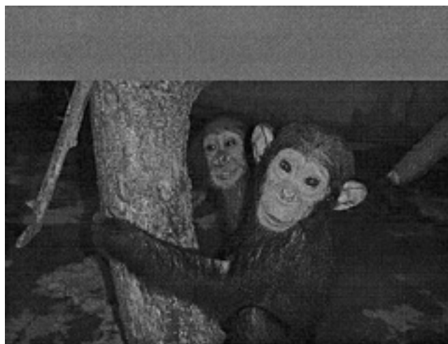
Baby Chimpanzees in the Orphanage at Lwiro