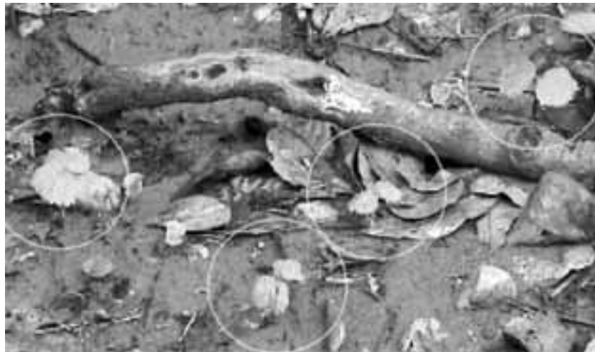
Figure 2 Seedlings of Cordia millenii which germinated from chimpanzee feces.