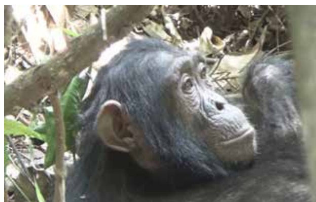
Figure 1. Close-up of Quinoko, a five-year-old orphan female in 2018

The study was conducted on the M group chimpan-