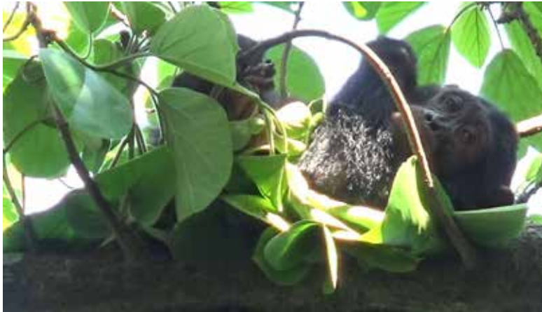
Figure 3. Quinoko resting on a high tree

This means juveniles are still dependent because they lack sufficient knowledge for foraging. However, as we observed in Case 2, Quinoko ate fruits several times and did not seem to have difficulty in finding and eating fruits. At this time, Saba and Pycnanthus , both Mahale chimpanzees' major foods, were beginning to fruit in many places. Thus in such a season, the demerit of being alone on foraging may not be so obvious.